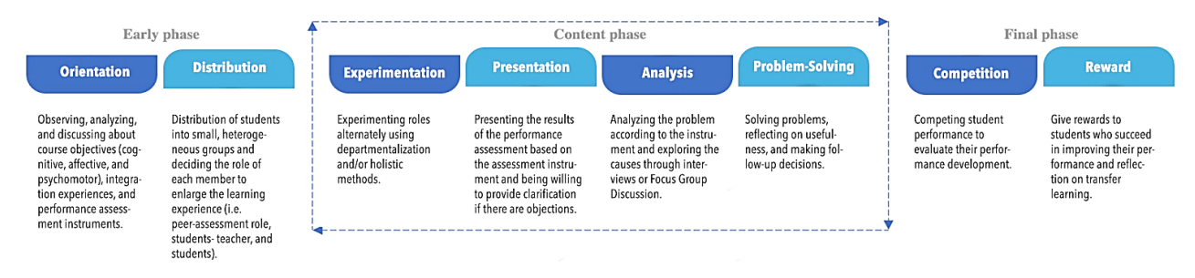
Figure 3. Integrated learning model syntax

The integrated learning model promotes student-centered learning experiences by stimulating learning behaviors that are oriented (goal-setting) towards future skills and analytical towards various changes and progress and also encourages constructive and transformative learning behaviors through the creation of integrated learning environments and experiences that are functional, comprehensive, and communal that mutually support and empower various potentials to achieve progress together. The eight syntaxes of the integrated learning model (from the orientation to the reward phase) are concisely elaborated in the following discussion (see Figure 3).